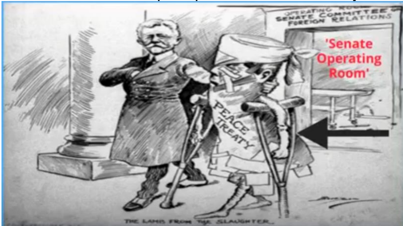
'The Lamb from the Slaughter' by Clifford K. Berryman

6. What constitutional principle does this cartoon symbolize?